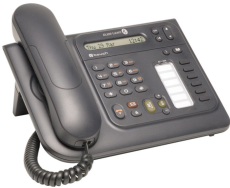
Alcatel-Lucent IP Touch 4008EE/4018EE Phones

The Alcatel-Lucent IP Touch™ 4008/4018 Extended Edition (EE) phones are cost-effective, entry-level desk phones that offer integrated IP connectivity and basic telephony.